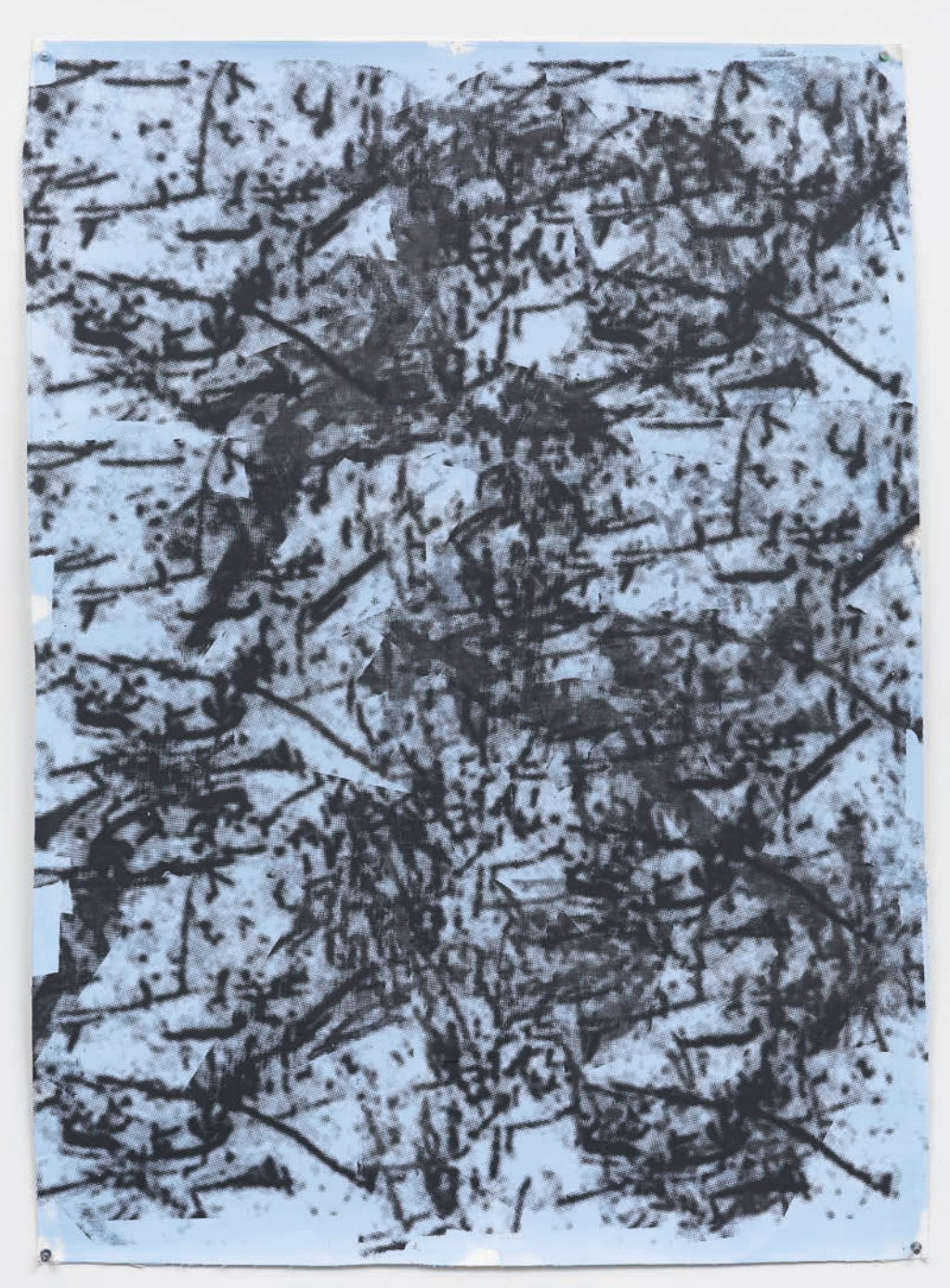
Unhinged #1 2019, silk screen on unstretched poly canvas with stainless steel eyelets, 110 x 80 cm