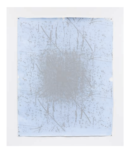
Pulling the Wool over your eyes #3 2019, silk screen on unstretched poly canvas with stainless steel eyelets, 140 x 110 cm

The plot thickens when we consider Rak's choice of colour palette. It is hard to avoid tuning in to it, and intentionally so. The lolly-bright turquoise, pink, blue, and yellow scream kitsch, rather than the sober tones that many associate with printmaking and its use throughout its storied past.