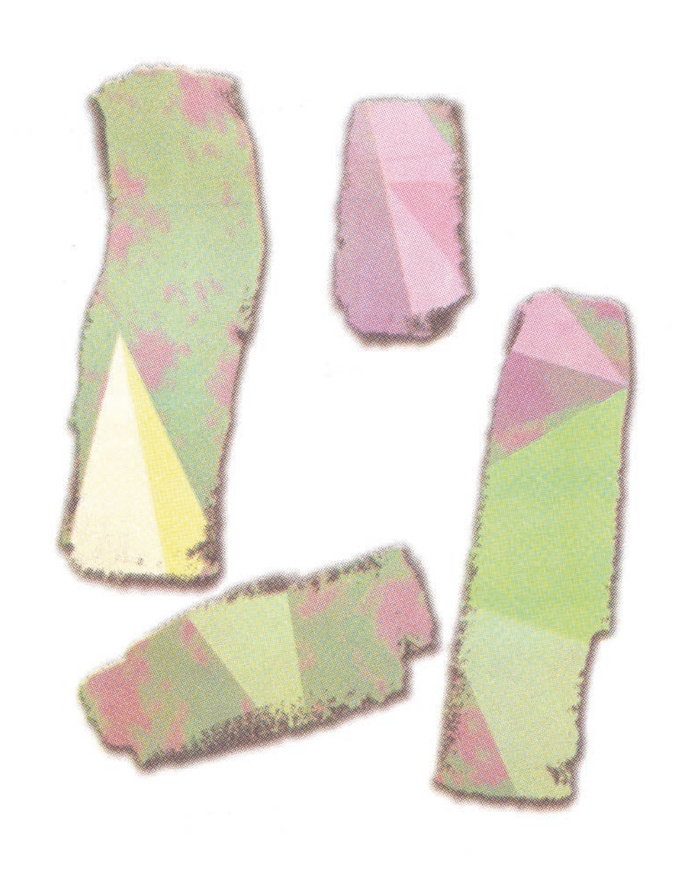
Detail, Halftone\ it\ down 2019, silk screen on paper, 6 panels at 56 x 76 cm each