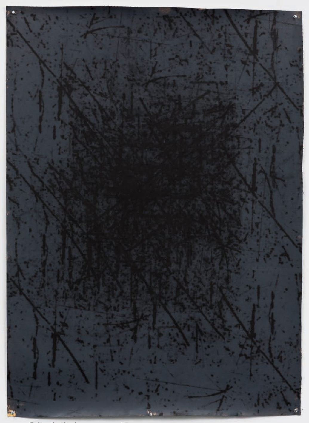
Pulling the Wool over your eyes #4 2019, silk screen on unstretched poly canvas with stainless steel eyelets, 130 x 110 cm ^{\circ}