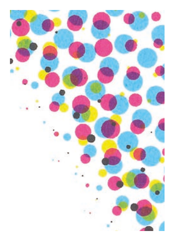
Detail, Halftone it down