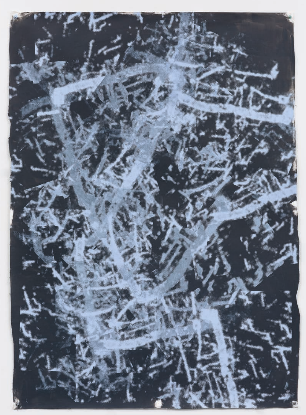
Unhinged #2 2019, silk screen on unstretched poly canvas with stainless steel eyelets, 110 x 80 cm