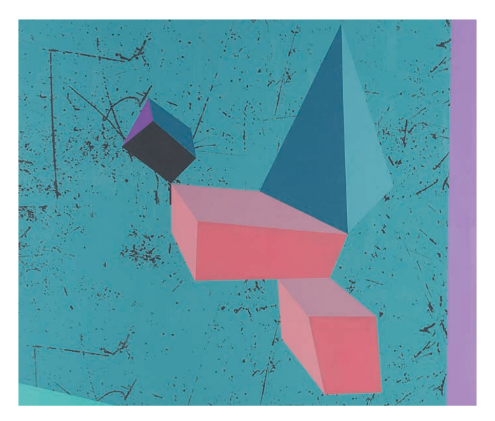
Detail, Painting of scratches #5 2017, acrylic and silk screen on board, 120 x 80 cm

Chloé Wolifson is a Sydney-based writer, researcher, and curator. She contributes regularly to publications including Art Monthly Australasia , The Sydney Morning Herald, ArtAsiaPacific, Art Collector , and Vault .