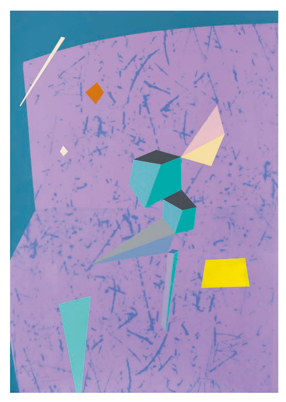
Painting of scratches #4 2017, acrylic and silk screen on board, 120 x 80 cm