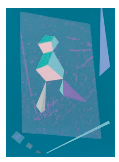
Painting of scratches #6 2017, acrylic and silk screen on board, 60 x 50 cm

This attitude reveals an inherent bias in an audience that has long held the singular nature of painting superior to the seriality of printmaking, a bias that Rak exploits through a series of manoeuvres in his Paintings of scratches . He snaps these foul bites with a smartphone camera, building up a library of digital images that are then used in repetition to develop screen-printed compositions. In the absence of any deliberately etched imagery lie gritty fields of abrasions. Atop these float a number of geometric shapes - solids with planes rendered in unblemished flatness - conjuring up three-dimensionality. One would think that these shapes, so cleanly executed. are the product of the printmaking process. However, they are actually painted.